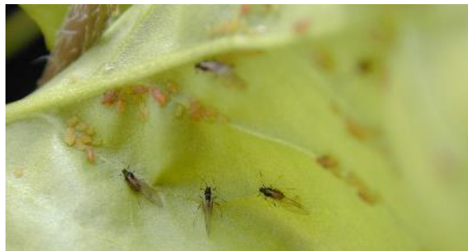
Demonstrating winged versions of an aphid population

Damage symptoms: Twisting and stunting of plants, sooty moulds forming on leaves near exposed honeydew.