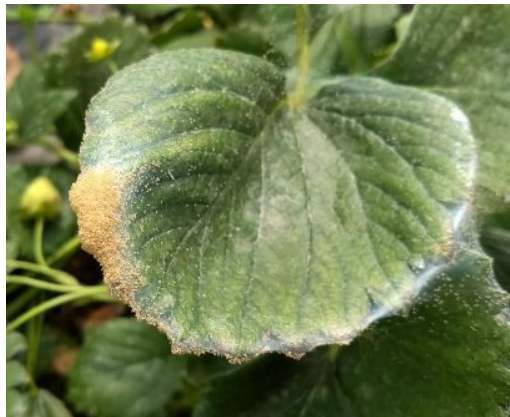
Example of damage and webbing that TSSM cause.

Damage symptoms: Pale or yellow spots on the upper surface of a leaf, bad infestations cause webbing.