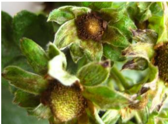
Example of damage caused to strawberry fruit

Damage symptoms: Twisting, curling and stunting of new growth, browning and drying of fruit.