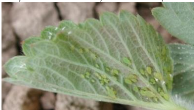
Showing typical hiding place for aphid populations

There are many species of aphids present in soft fruit crops, all of them damage plants by sucking sap which they then excrete as honeydew and can cause sooty moulds to develop.