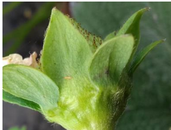
Thrips hidden behind the calyx.

Damage symptoms: Bronzing of the fruit, browning on petals and white flecking on leaves.