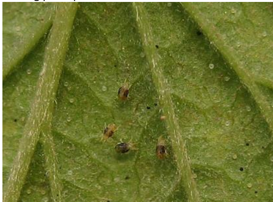
Example of two spotted spider mite on strawberry leaves.

TSSM are extremely small pests that feed on a wide variety of crops, its damage is caused by sucking the contents from plant cells leaving pale spots. Infestations are worse in hot and dry weather.